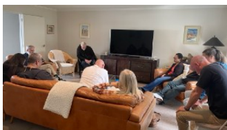
Spending time praying for each other

"We look forward to this with excitement and leave knowing that our batteries have been recharged."